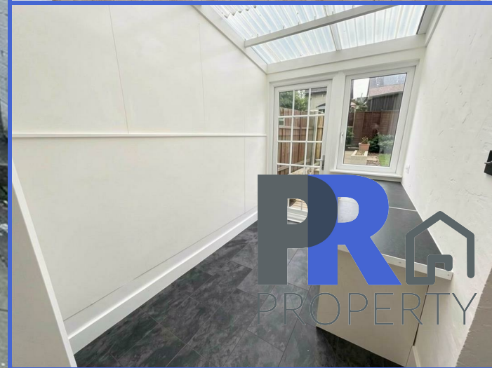
104 Frederick Street, Luton, LU2 7QU £1,500 PCM